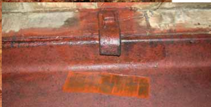
These two bridges are in the same valley coated in the same year.