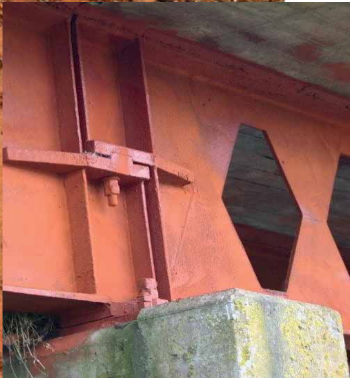
Goldseal moisture proofs the steel flange and pile connection.