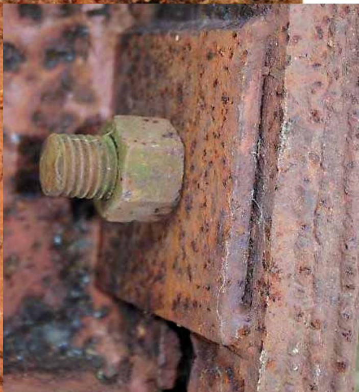
Goldseal CSI can be applied directly to clean descaled steel. It will seal the nut, bolt and unwelded front crevice

In this case Goldseal will fill crack damage to concrete and prevent or terminate spalling. It will seal the concrete to steel interface and encapsulate the steel repair with minimal preparation and no grit blasting.